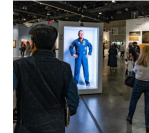
Mar 1, 2022 3D Holoportation for the Masses