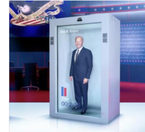
Mar 3, 2022 Proto Leads Field in Business Travel Replacement via Holograms