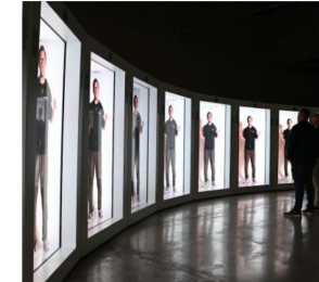
Feb 28, 2022 Proto Hologram is making Waves with its 3D Devices