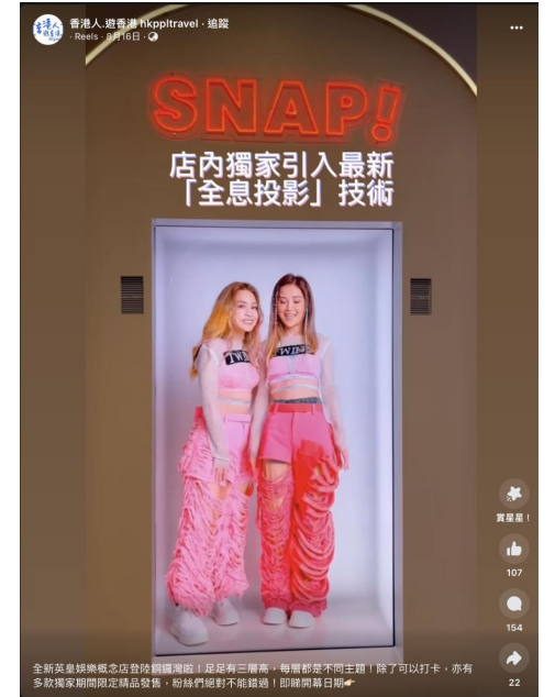
全新英皇娛樂概念店登陸銅鑼灣! 足足有三層高, 每層都是不同主題! 除了可以打卡, 亦有多款獨家期間限定精品發售, 粉絲們絕對不能錯過! 即睇開幕日期