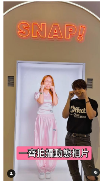
playeahk · Follow 容祖兒 · 陪我長大

playeahk 1 d 英皇娛樂期間限定概念店0 e:effect Concept Store 發售本土藝術家聯乘設計限量精品 EEG 藝人打卡位 直播互動 busking 專區 獨家發售明星私藏 收益作慈善用途