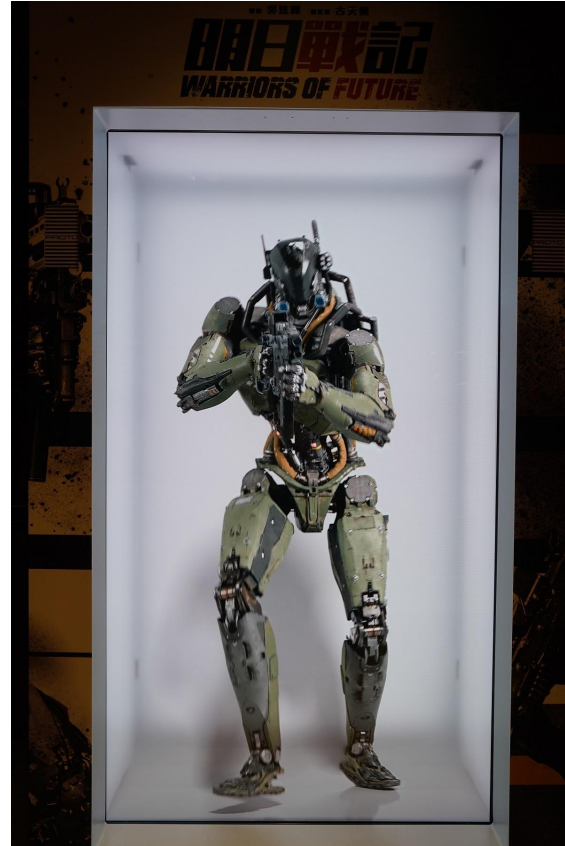
古天樂- 明日戰記 Warriors of Future

We have delivered this next gen hyper realistic AI interaction experience with financial services & entertainment organizations to deliver new ways to engage with their customers.